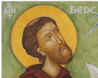
Tamara Penwell – Iconography