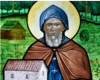
Benjamin Finn – Stained Glass