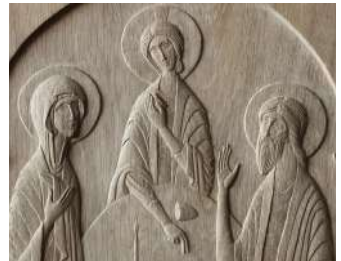
Ewan Craig – Sculpture