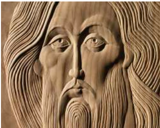
Ewan Craig – Sculpture