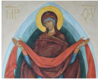
Tamara Penwell – Iconography