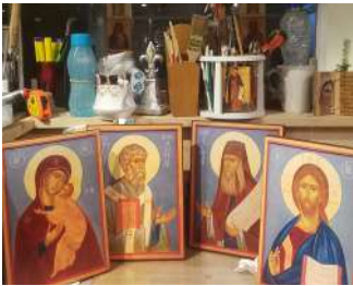
Priceless Imagery – Mounted icons