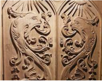
Raphael Bates – Wood carving